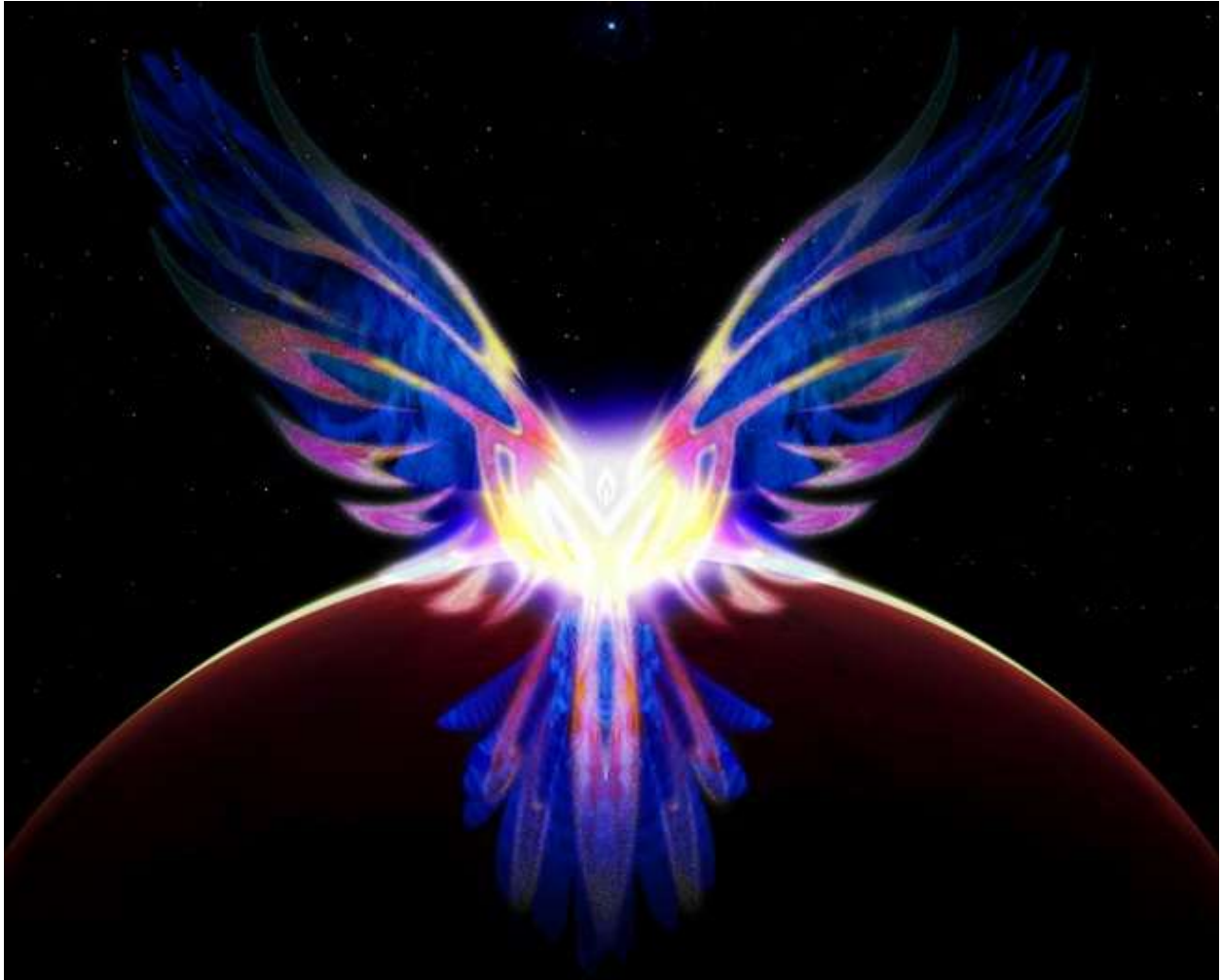
The Phoenix , by Francis Donald

Geometry and sacred number: Whereas the earlier image 'Ascension' is based on the Fixed Cross, the underlying construction of 'The Phoenix' is an elongated trefoil knot (shown below): a symbol of eternity (because of its unbroken motion) and of the inherent unity of the three aspects of divinity (suggested by the central triangle it forms).