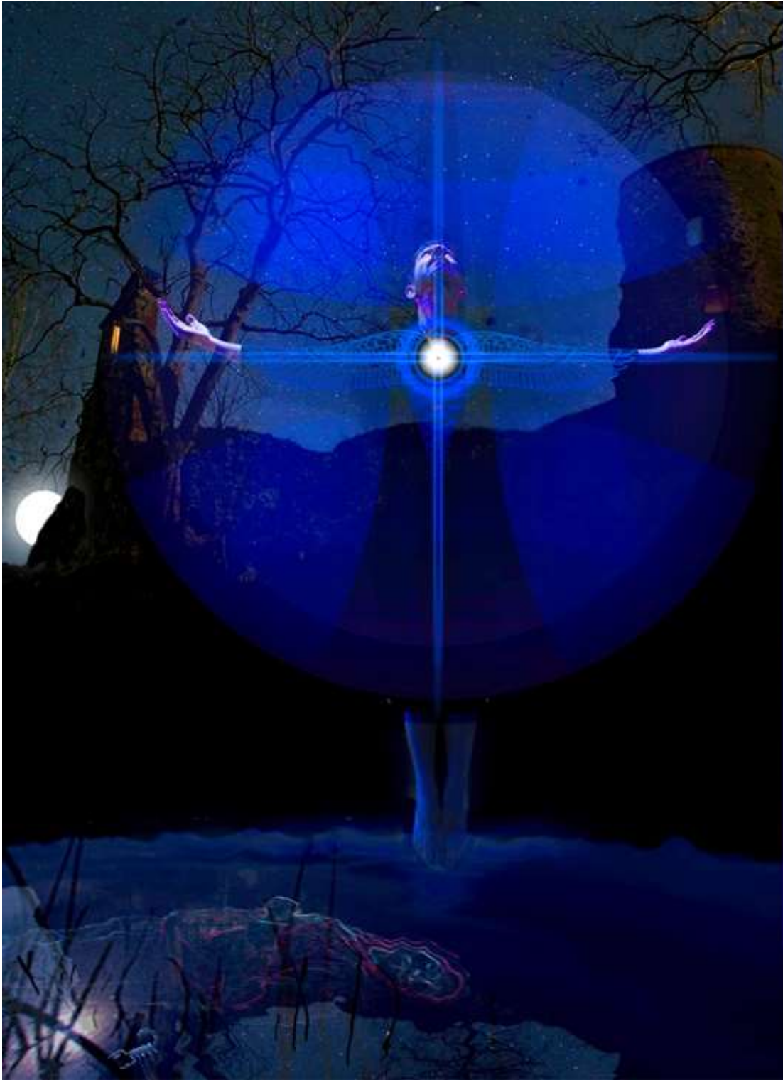
Ascension , by Francis Donald