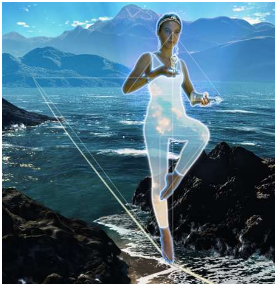
Geometry, by Francis Donald

The geometry of the figure portrayed is based on the 3-4-5 Pythagorean triangle, used to construct many of Egypt’s ancient pyramids as the image below shows.