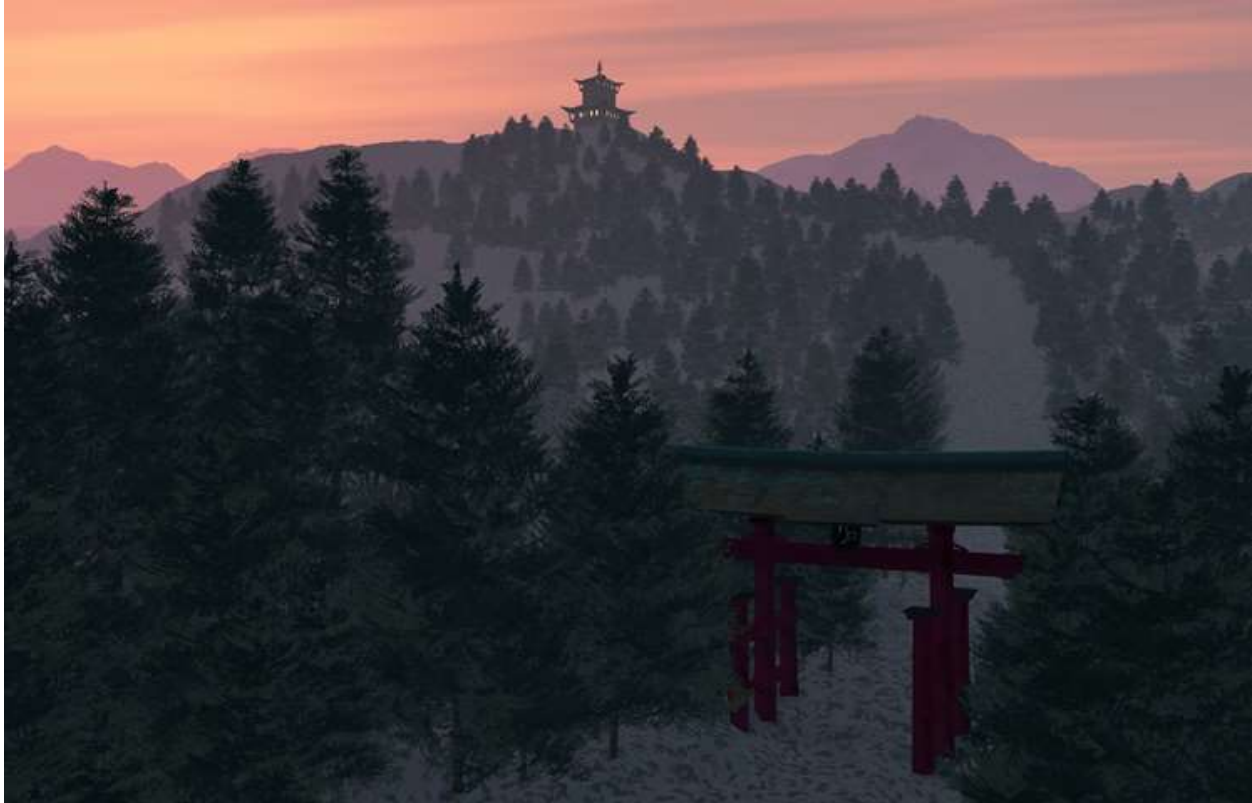
Gompa , by Francis Donald

As we ascend, we get an occasional glimpse through the trees of another mountain, one that dwarfs the foothill we are climbing. “That must be the true mountain,” we think to ourselves. In fact, the more of it we see, the more absorbed we are in its Presence, and the less we seem to notice the difficulties of the path we walk. Upon our arrival at the Gompa, we find ourselves among other seekers, all gazing eastward, lost in contemplation of an unimaginably loftier summit.