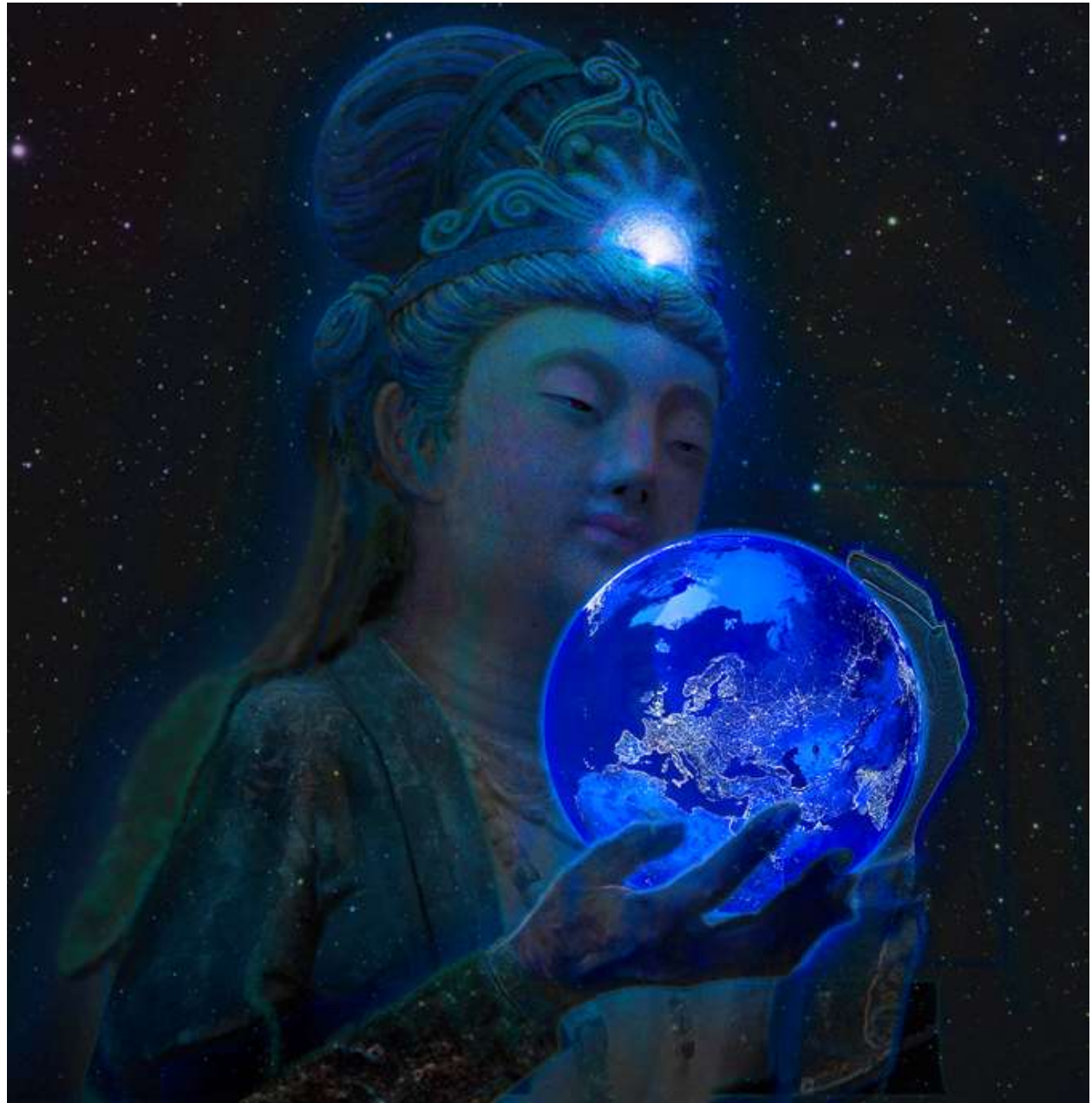
The Water Carrier, by Francis Donald

Depicted here is the great Aquarian archetype, the ultimate water-carrier. Everyone alive today is touched by her hand; for the 'vessel' she carries is now well within the influence of this great sign. It is a soul-awakening influence: " The water-carrier (another name for the world server) is... found in every land and in every great city. They work on all the different rays; they express many points of view; their field of service is widely differing... They all carry the pitcher containing the water of life and they all emit the light in some degree throughout their environment... To you, who live and work in this interim period and in this cycle of transition,