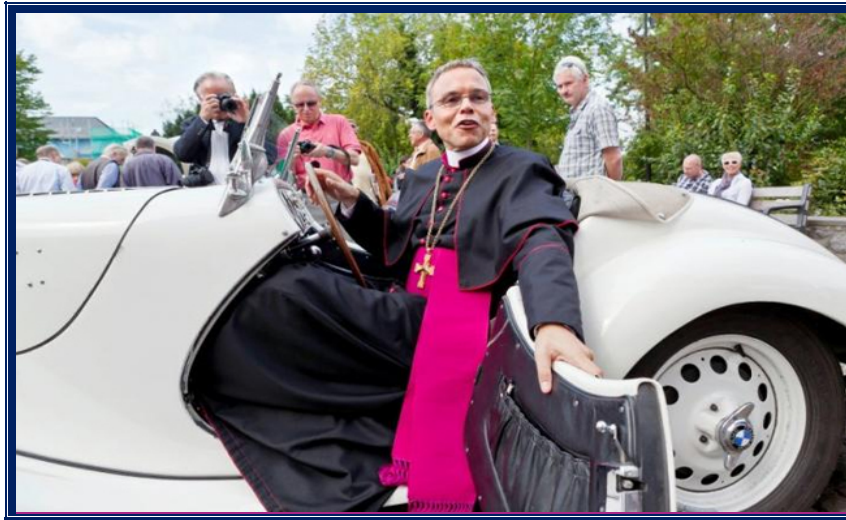
The 'Bishop of Bling', Bishop Franz Peter Tebartz-van Elst